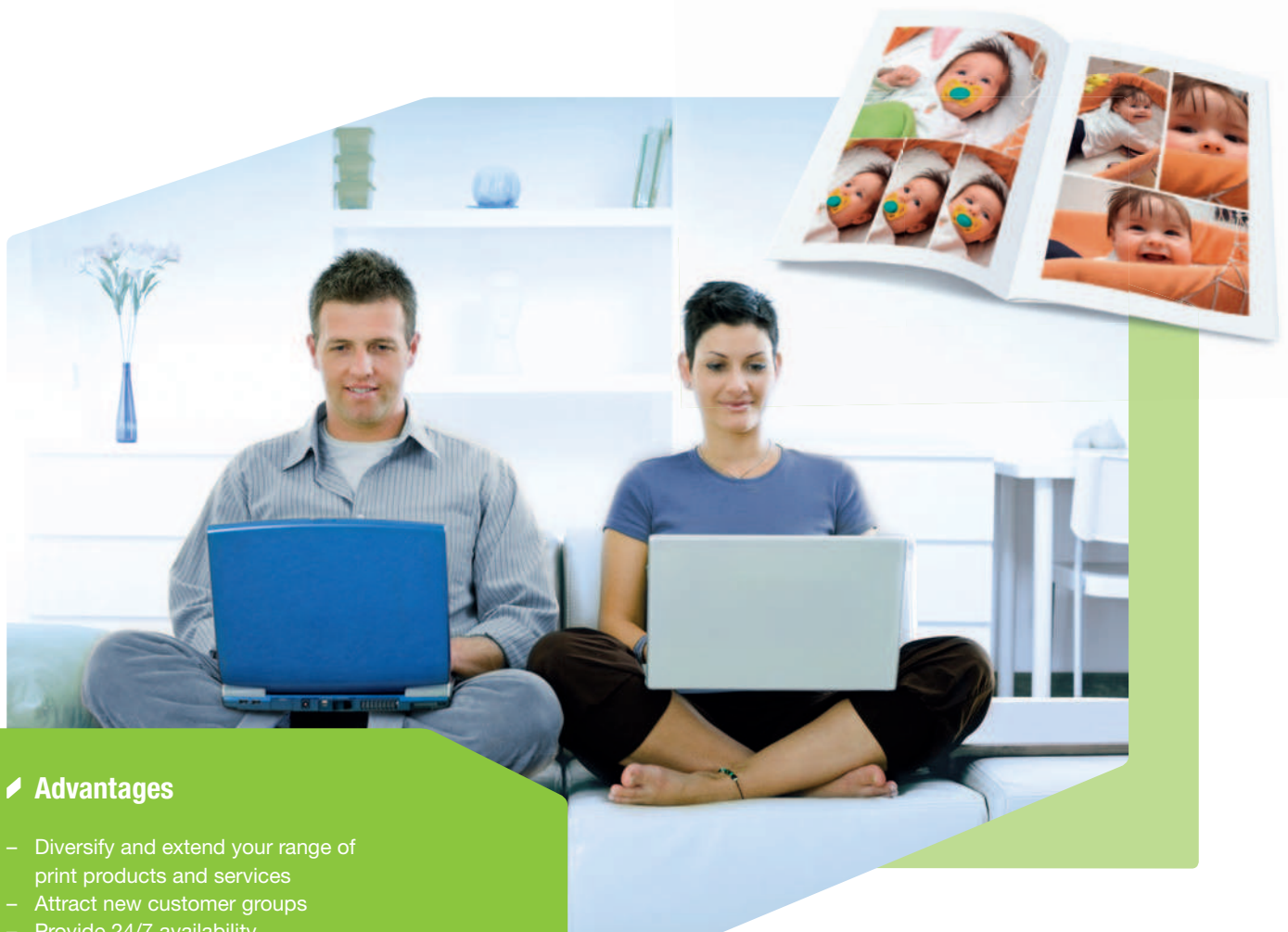
Photo book creation is an easy and attractive enhancement of your online print offering. Via a photo book application, you provide your customers with easy yet extensive online layout possibilities to create albums or calendars with their photos of holidays, events and other occasions. Similar to other web-to-print applications, photo book software includes online submission, payment and tracking, right down to the final delivery or collection of the printed photo book.

“Expand your services and grow your revenue.”