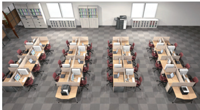
Example of optimal placement with A3 bizhub MFPs

Konica Minolta's consulting service that proposes the optimal placement of devices to streamline the office document environment and further reduce total cost of ownership (TCO).