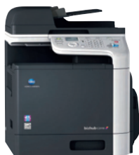
C3110 model shown.